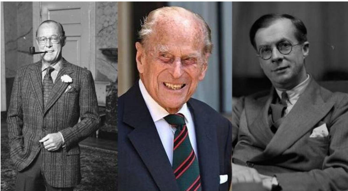
Three useless eaters fond of projection: Prince Bernhard, Prince Philip and Sir Julian Huxley

Philip himself maintained the family tradition, when founding the World Wildlife Fund (WWF) with fellow one-time Nazi Party member Prince Bernhard of the Netherlands , a lifelong eugenicist and Bilderberg Group founder, in 1961. Philip and Bernhard were joined by Sir Julian Huxley (then president of the Eugenics Society of Britain) as WWF co-founder.