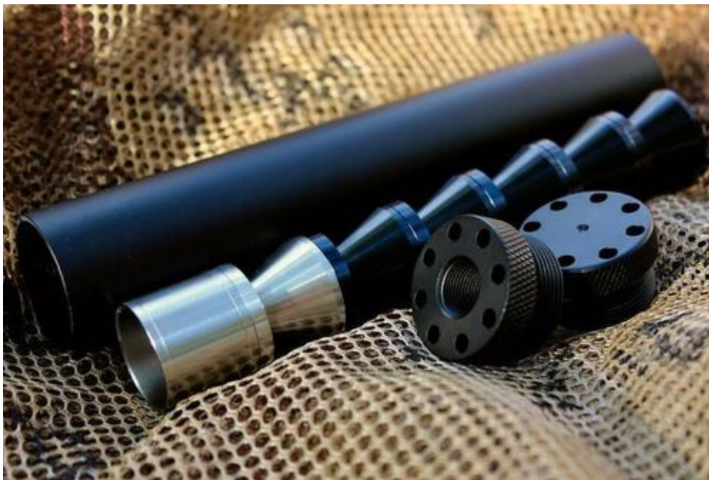
This is a solvent trap.