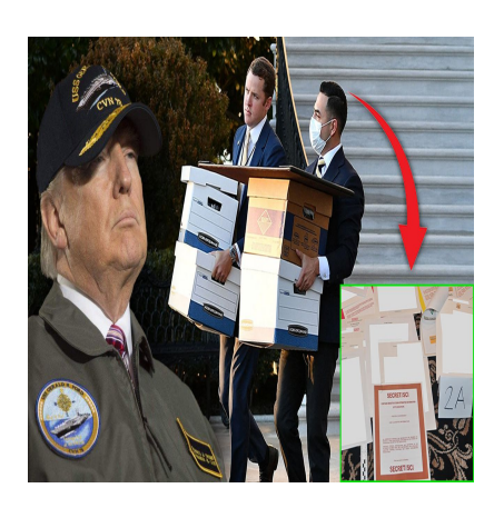
FBI Took Top Secret List Containing Names of VIP Pedophiles During Trump Raid