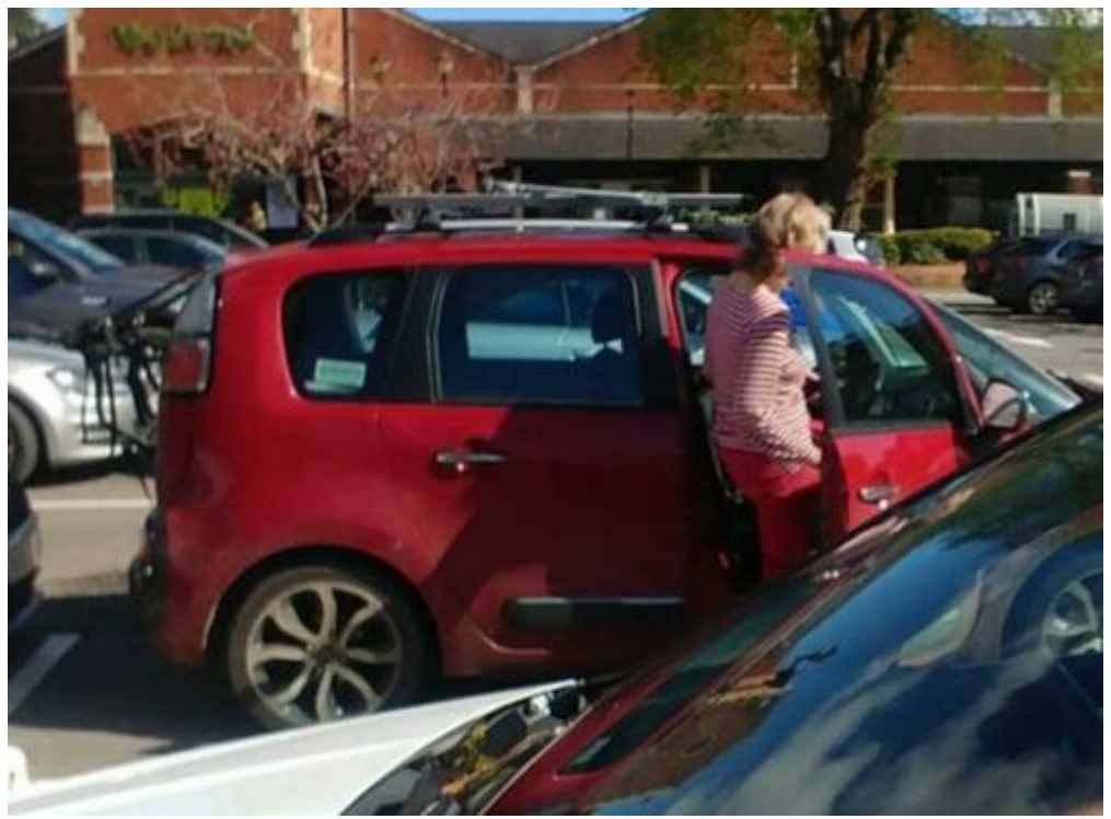
Bradbrook left the supermarket in a diesel-powered car

One onlooker <u>summarized</u> the spectacle this way: "Buying fruit flown halfway round the world in non-recyclable packaging then driving home in a diesel motor — what a towering hypocrite. "