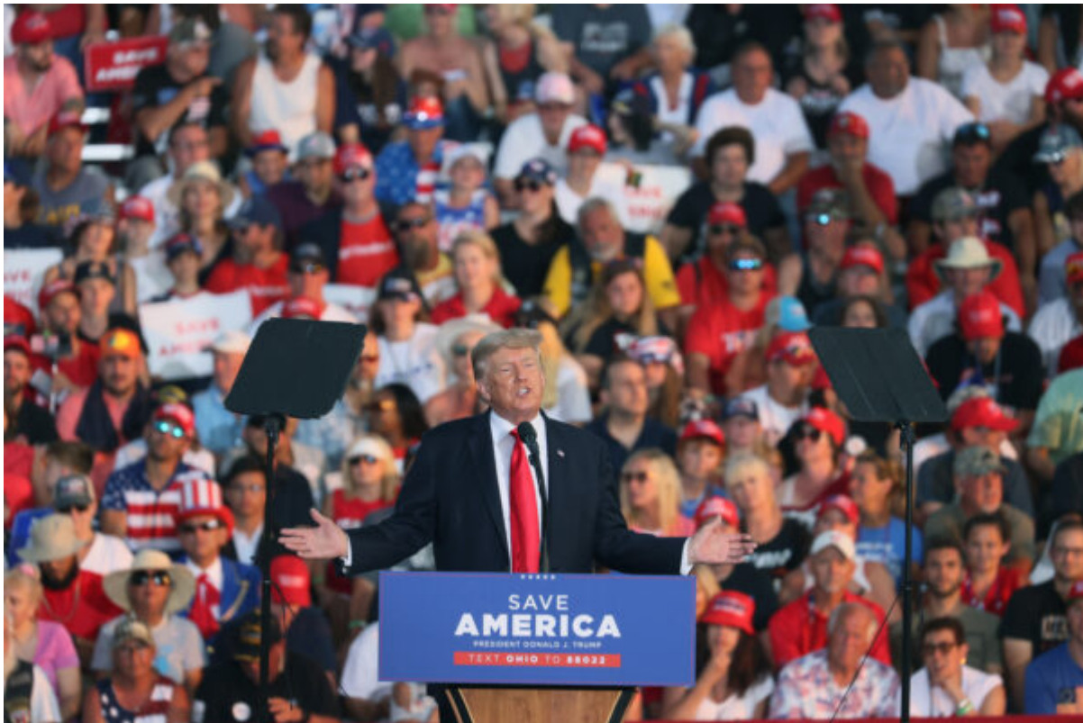
Former President Donald Trump speaks to supporters during a rally at the Lorain County Fairgrounds in Wellington, Ohio, on June 26, 2021.