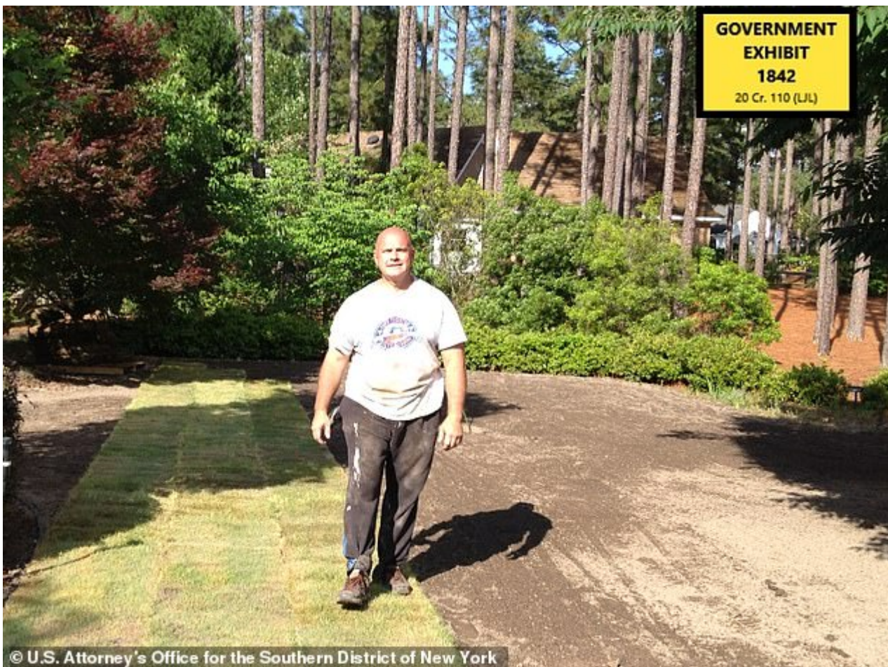
PICTURED: Larry Ray outside his stepfather's home in Pinehurst, North Carolina