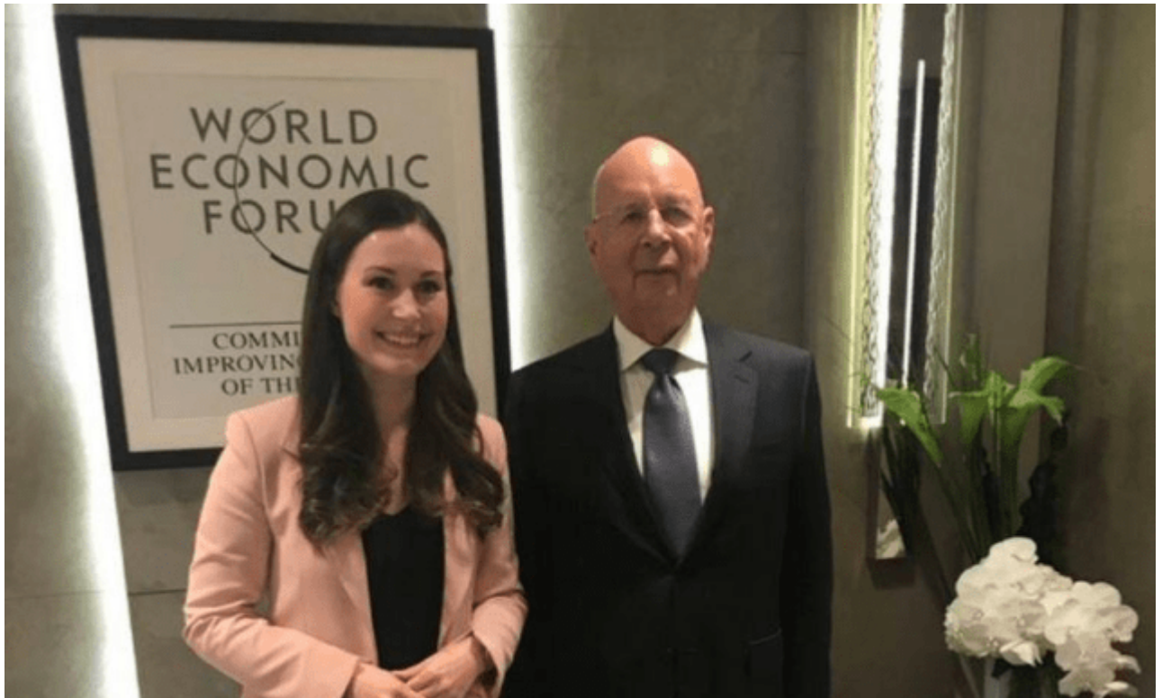
Sanna Marin with Klaus Schwab, founder of the WEF

Sanna Marin, Prime Minister of Finland, is another Young Global Leader who has made her mark on the international stage.