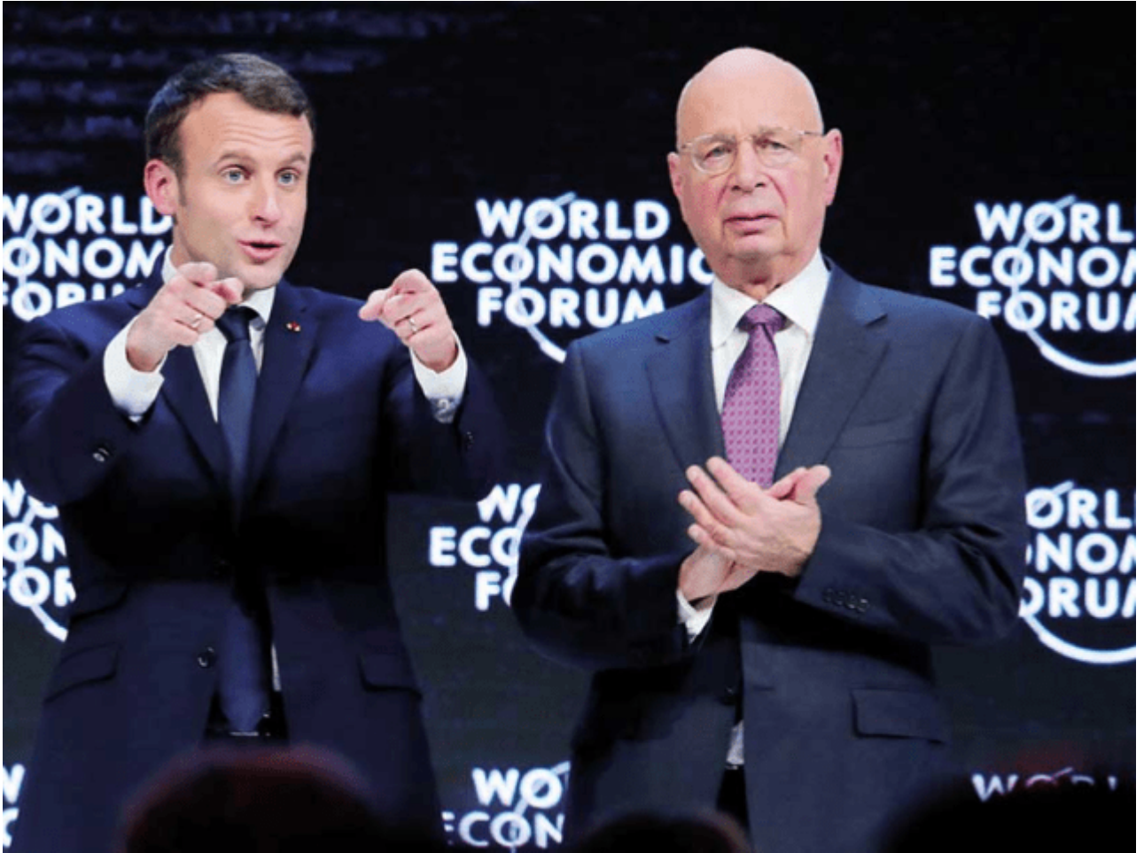
Macron with Klaus Schwab

President Emmanuel Macron has implemented several policies that align with the World Economic Forum's (WEF) globalist vision and goals, and many aspects of his policies will have dystopian implications.