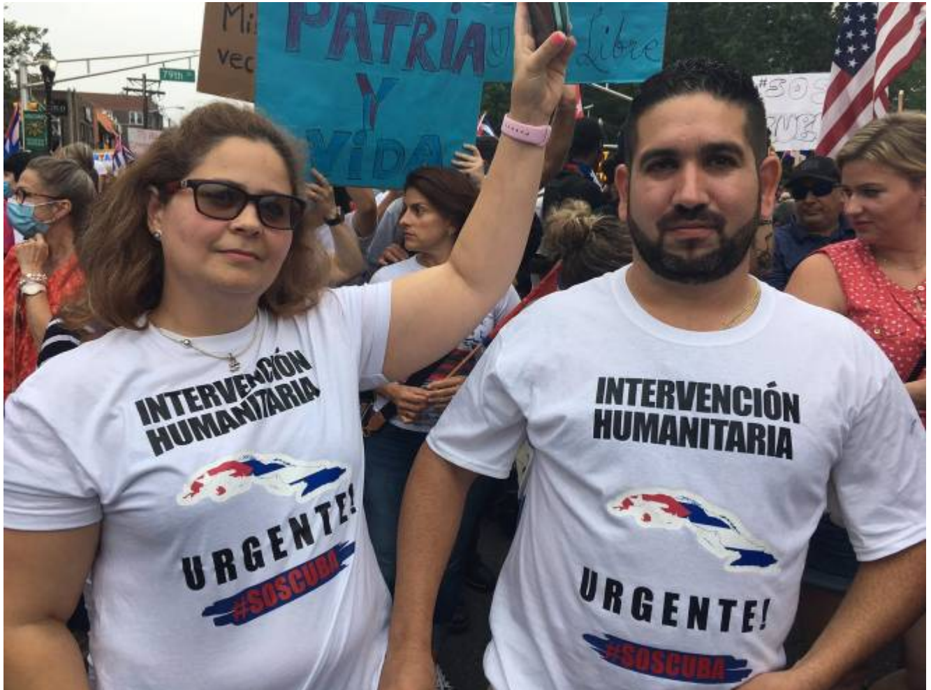
Rally-goers “urgently” call for “humanitarian intervention”

to be proficient in English and speak English at home than the overall foreign-born population. In FY 2018, about 61 percent of Cubans ages 5 and over reported limited English proficiency, compared to 47 percent of the total foreign-born population.” Ordinarily you’d think US conservatives would be especially exercised about a thing like this, but they don’t seem too worried at the moment.