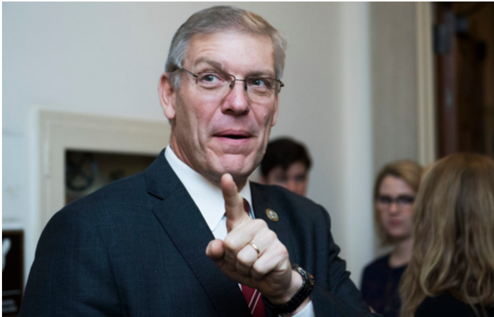
Georgia Republican Rep. Barry Loudermilk

Loudermilk explain why he was giving a tour of the Capitol the day before the riots – implying that he may have been doing reconnaissance for the next day's riot.