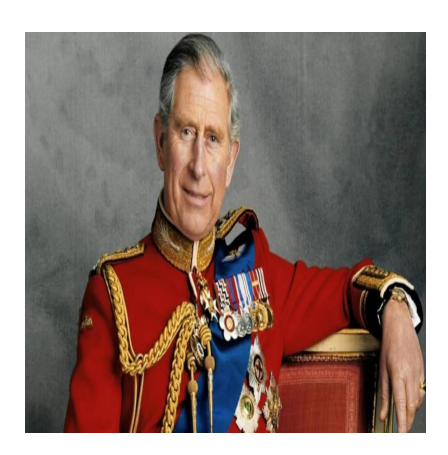
Can Britain Break From Feudalism or Will King Charles' Great Reset Go Unchallenged?