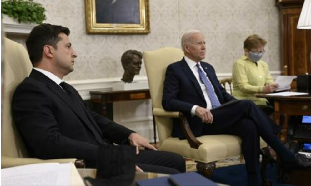
A prior Biden-Zelensky summit at the White House, file image

In his latest remarks, Biden admitted that the possibility of Putin launching a full-scale invasion may have seemed far-fetched at the time, acknowledging, “I understand why they didn’t want to hear it.”