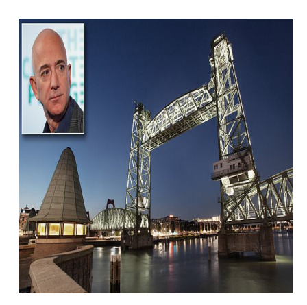
Bezos' $500 Million Superyacht Trapped At Dutch Shipyard