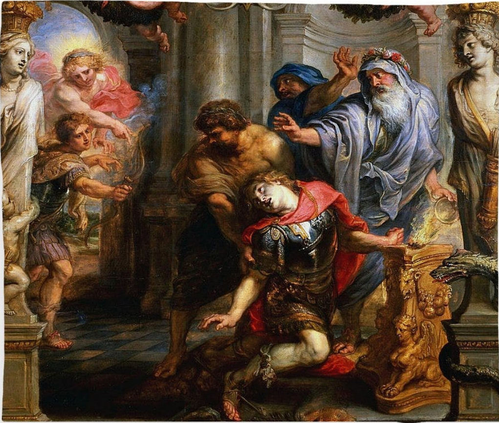
The Death of Achilles, Rubens