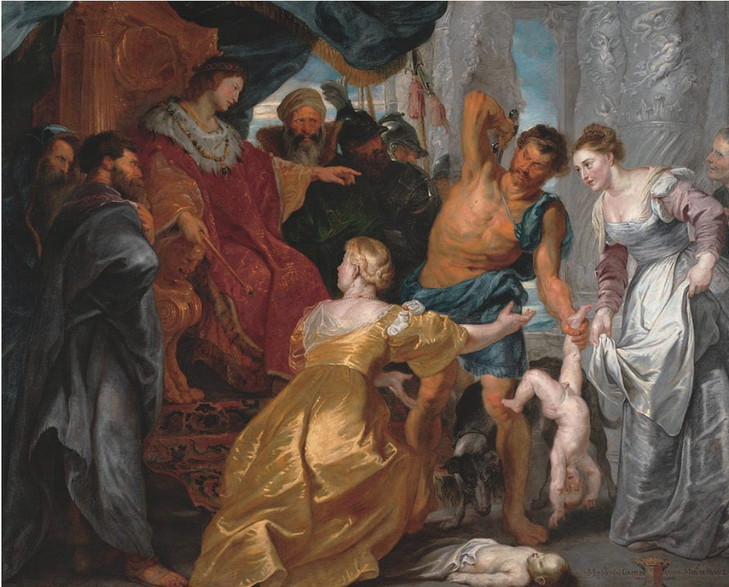
The Judgment of Solomon , Rubens, 1617

This summer, in a speech marking the occasion of the CIA's 75th birthday, President Biden struck a quite different note than he did in Philadelphia, reciting what the CIA instructs all presidents: that the soul of the institution really lies in speaking truth to power.