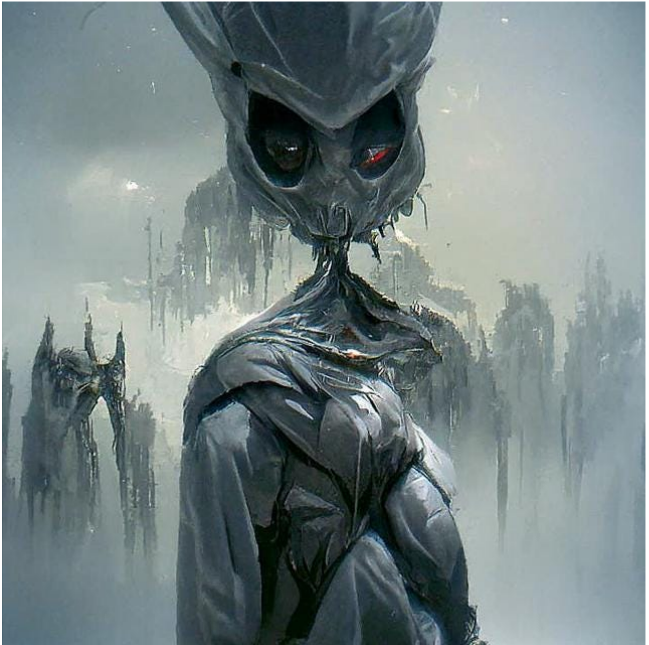
AI generated image of “grey alien”

Where did we get the idea that aliens look like the generic “grey” alien? That classic Close Encounters of the Third Kind alien with the oversized head on an elongated thin frame. I believe the image comes from demons. Very early in the 20th Century Aleister Crowley claims to have channeled an entity called Lam, and Crowley drew what is now a famous picture of this entity (demon). This is it: