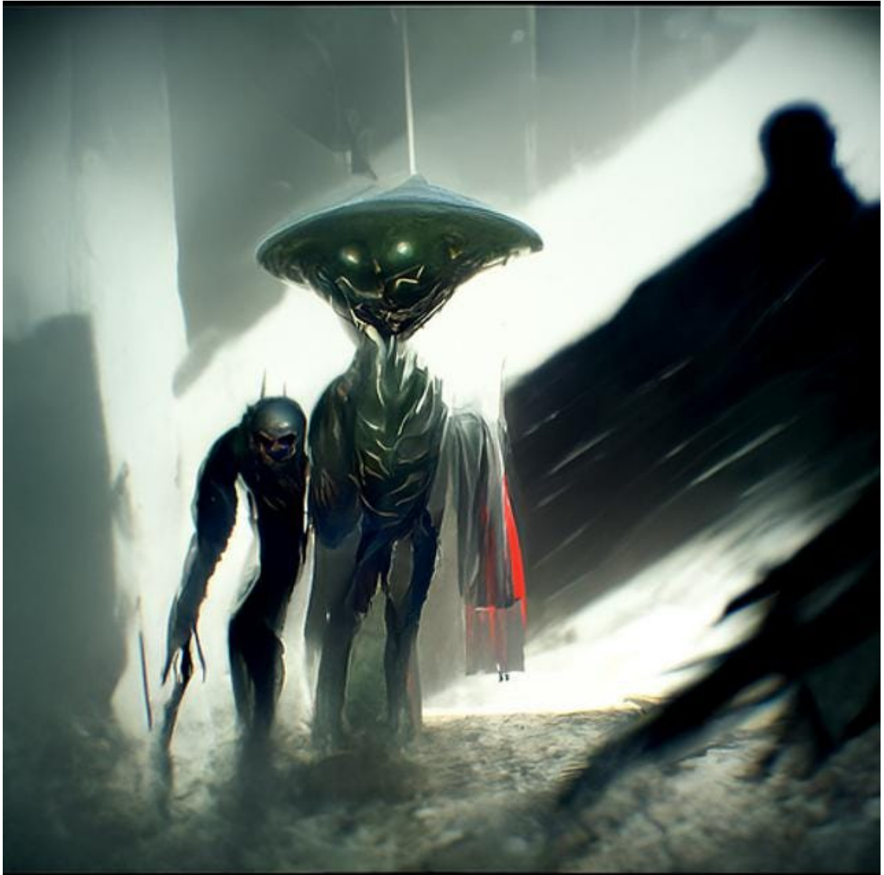
AI rendition of “alien abduction”

I think this topic of alien abductions is where the rubber meets the road. Here we have greys making incursions into peoples lives, often with sexual acts and spiritual overtones.