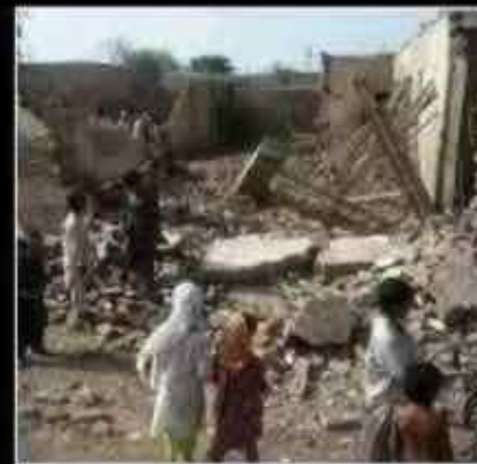
What Pakistan thinks I do