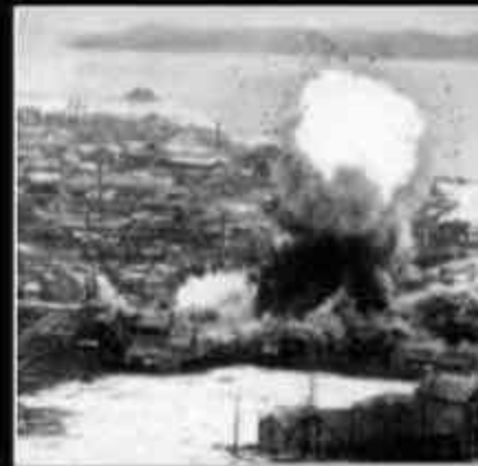
What Korea thinks