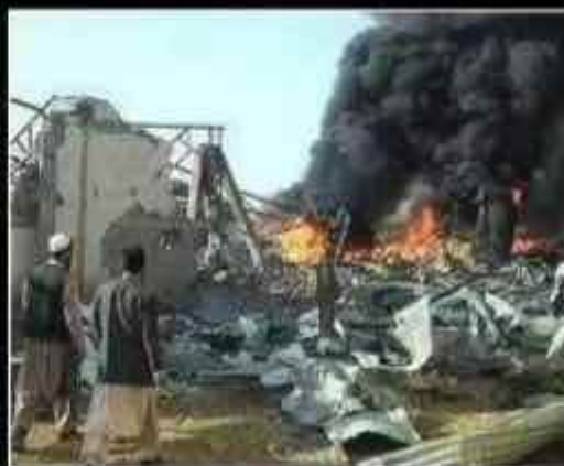
What Iraq thinks I do