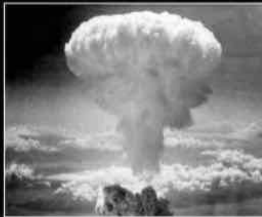
What Japan thinks I do