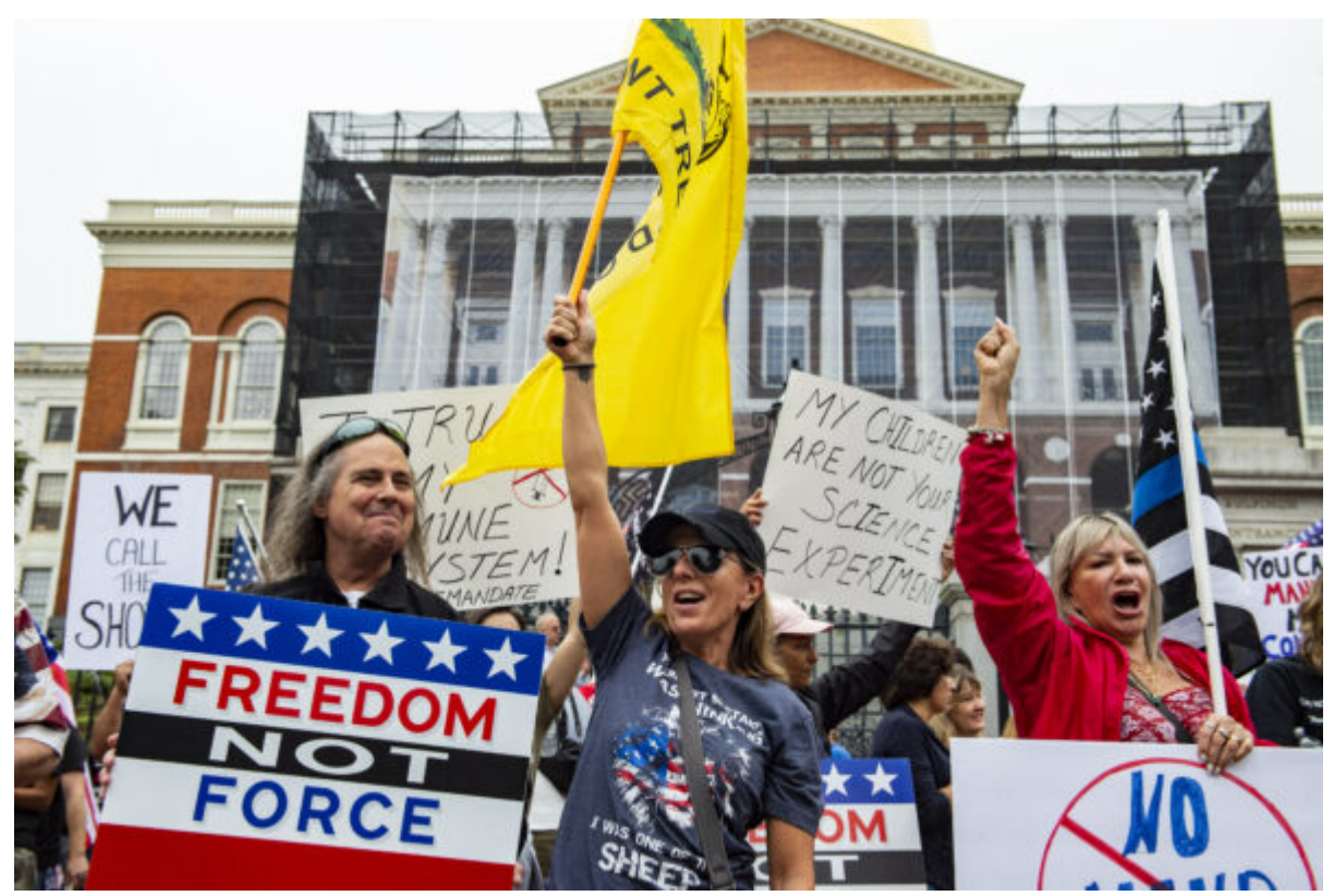
Demonstrators gather outside the Massachusetts State House to protest COVID-19 vaccination and mask mandates in Boston on Sept. 17, 2021.

U.S. District Judge Kathryn Kimball Mizelle ruled that the U.S. Centers for Disease Control and Prevention (CDC), which initially issued the mandate, had exceeded its authority and failed to seek public comment before issuing the mandate.