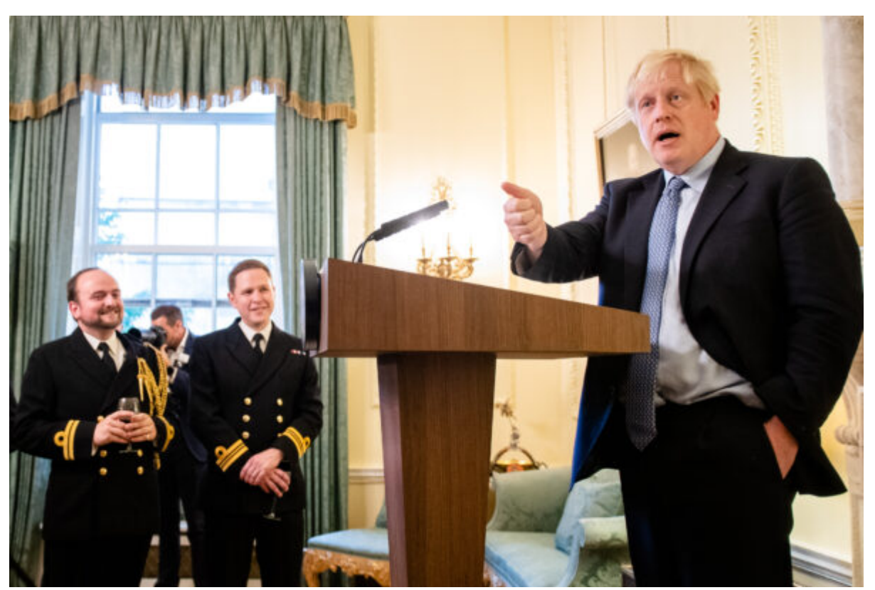
UK Prime Minister Boris Johnson hosts various members of the armed services at a military reception at 10 Downing Street on Sept. 18, 2019, in London.

On April 18, Scotland implemented its previously discussed changes on masks and dropped the legal requirement for most indoor locations and public transportation.